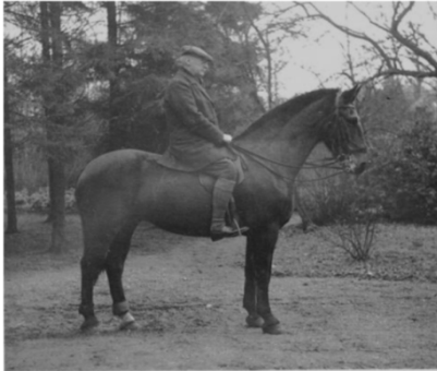
• BY B. RUYS ON HORSE